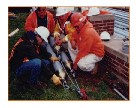
Tighten pulling eye so that it expands against interior of the conduit.