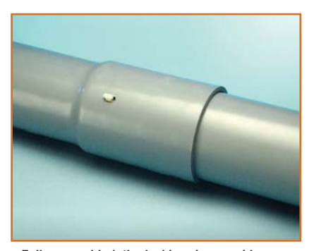
Fully assembled, the locking ring provides strong water-tight joints without cement.