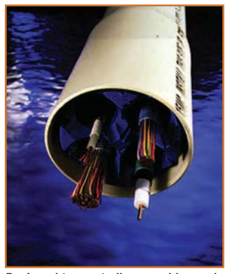
Designed to meet all your cable needs.