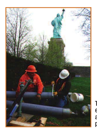
Trim spigot end before attaching pulling eye.