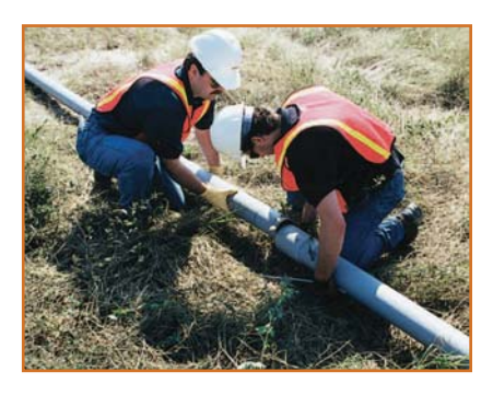
Attach the next piece of Bore-Gard.