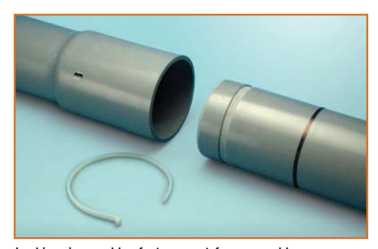
Locking ring enables fast, cement-free assembly.