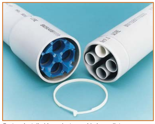
Factory installed innerducts provide immediate post bore cable installation