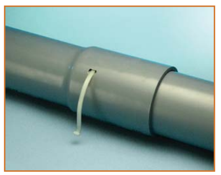
Slide locking ring into the joint.