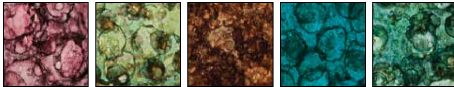
S01 Cranberry Fizz S02 Melon Patch S03 Root Beer Float S04 Tranquil Wave S05 Forrest Fantasy