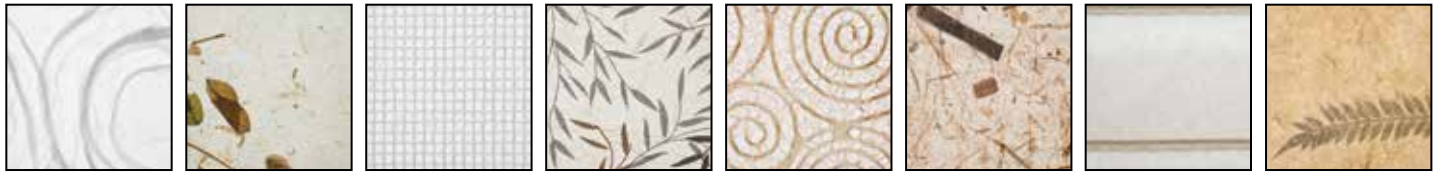
P01 White Swirl P02 Rain Tree P03 White Grid P04 Willow P05 Tan Scroll P06 Brown Nature P07 Cascade P08 Alma Leaves