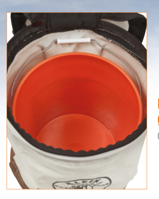
Holds 5 gallon bucket. Cat. No. 5104CLR17