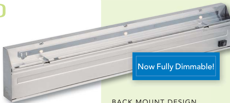
(A) 12057 SS

Design Pro LED Direct Wire offers trouble-free, energy efficient operation along with the simple installation of a self-contained unit. The dimmable version is designed and tested to work with a wide variety of dimming switches for a true range of light level control.