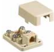
Telephone Surface Mount Jack, 6-Position, 4-Conductor, Screw Terminations