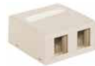
Multimedia 2-Port Surface Mount Box, Jacks Not Included