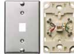
Wall Phone Jack, 6-Position, 4-Conductor, Screw Terminations