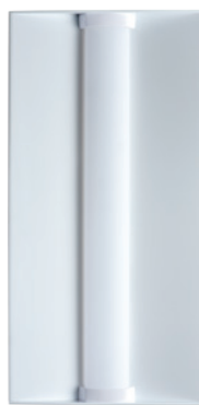
ZR24T™ - 2' x 4' LED Troffer