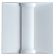
ZR22T™ - 2' x 2' LED Troffer