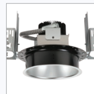
KR SERIES DOWNLIGHTS p.24 Effective, Efficient LED Downlights