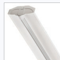
CS SERIES LINEAR p.58 Commercial Linear Solutions