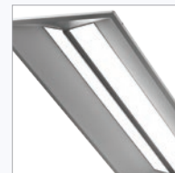
CR SERIES TROFFERS p.40 High-Efficiency, Affordable Troffers