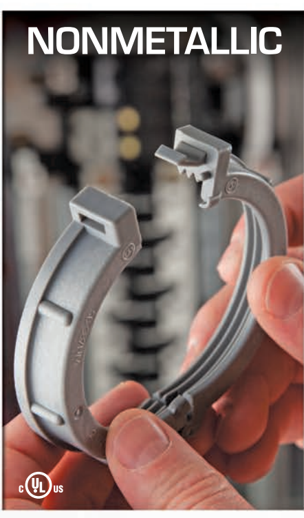
2 TO 4-INCH TRADE SIZES