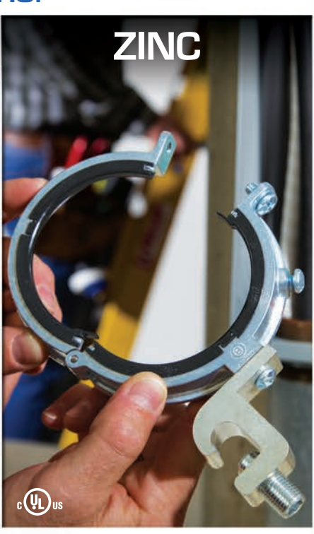
3/4 TO 4-INCH TRADE SIZES