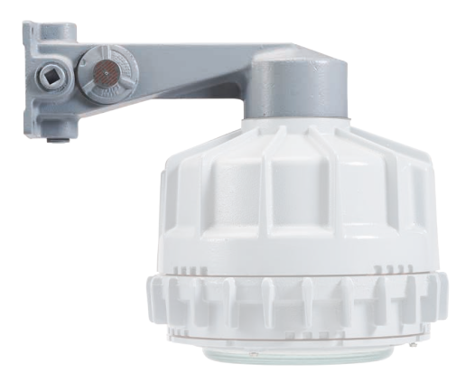
WALL BRACKET HOOD