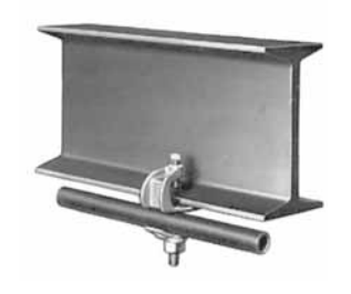
Single line of conduit running parallel to beam using "CH" hanger.