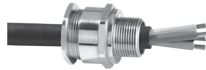
Dimensions in Millimeters (Inches)